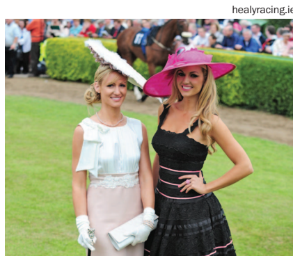
Dress up for a special occasion

you can adjourn to the next door Spearman's Tea Rooms for some sustenance. The event will take place from Wednesday to Saturday, October 26th to 29th and the showrooms will be open each day from 10am to 7pm. This is an extravaganza not to be missed, whether you are looking for something for a special occasion, for the races or just something smart for everyday use. There will be a range of accessories also available and details of the event can be had in advance by calling Lucinda on 086-8036536 or Shanny on 086-8247123.